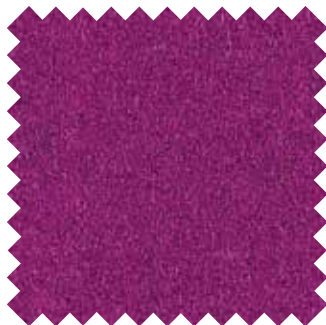
FACET 76 PRUNE