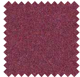
FACET 74 AUBERGINE