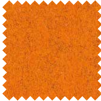
FACET 129 MANDARIN