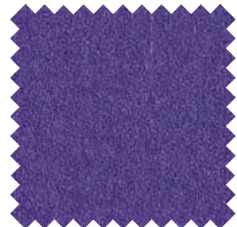
FACET 178 NIGHT SHADE