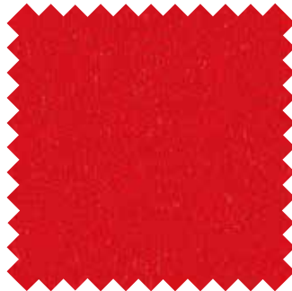
FACET 139 FIRE