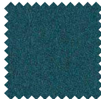
FACET 56 PETROL