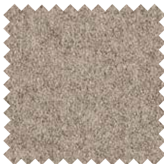
FACET 180 DOLPHIN