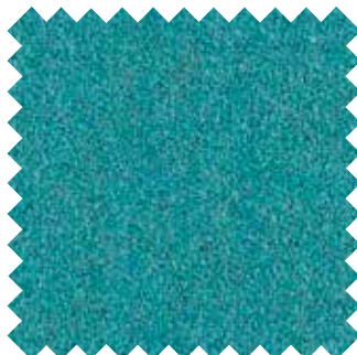
FACET 143 AQUA