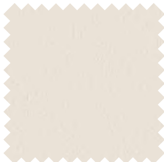
FACET 101 IVORY