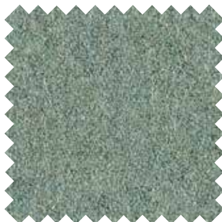
FACET 50 MINT