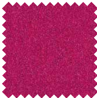
FACET 77 FUCHSIA