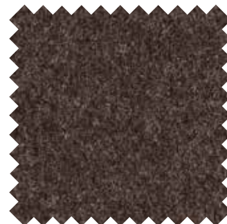
FACET 1008 TAUPE