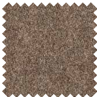
FACET 124 SHITAKE