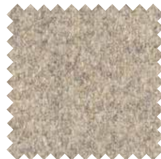
FACET 7 PEBBLE