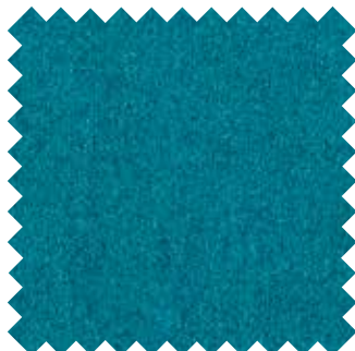
FACET 147 OCEAN BLUE