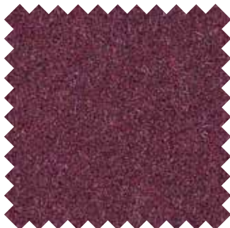
FACET 78 PURPLE