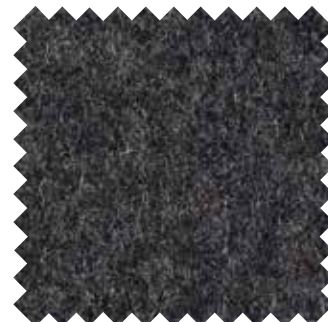
FACET 1001 MEDIUM GREY