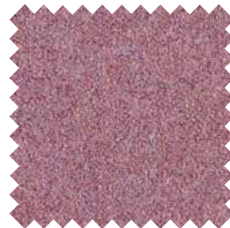
FACET 73 PINK