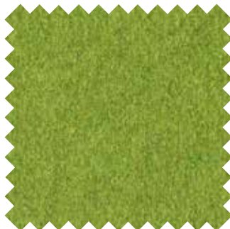
FACET 52 PISTACHE