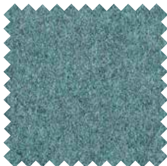
FACET 144 AZURE