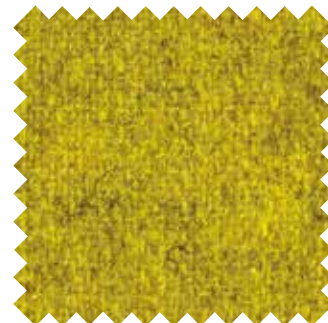
FACET 24 YELLOW