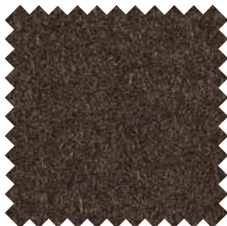
FACET 18 DARK BROWN