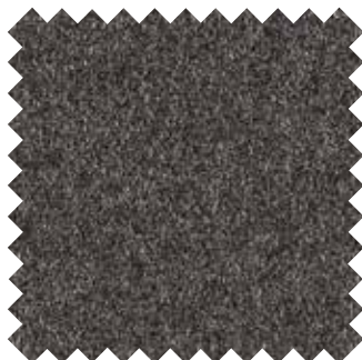
FACET 67 ANTHRACITE