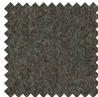
FACET 53 OLIVE