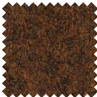
FACET 29 RUST