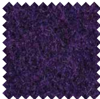
FACET 72 VIOLET