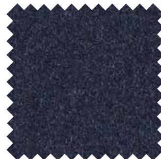
FACET 1007 NAVY