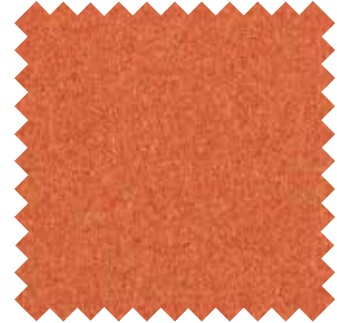
FACET 2012 B ORANGE