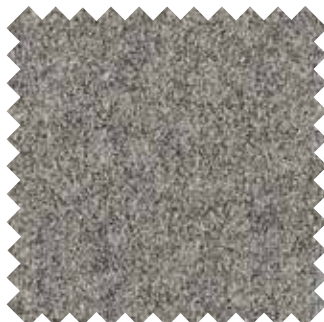
FACET 1000 LIGHT GREY