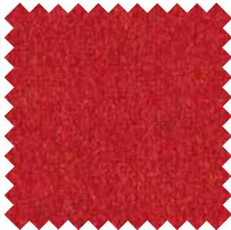
FACET 2011 RED