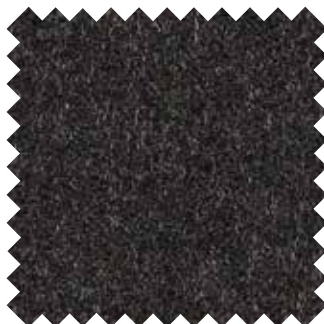
FACET 1003 BLACK