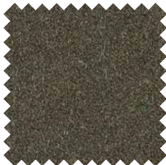
FACET 14 ARMY