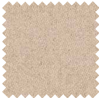
FACET 1037 BEIGE