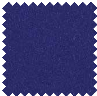
FACET 90 INDIGO