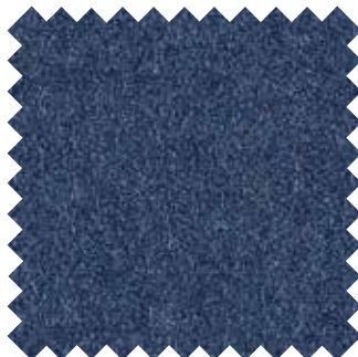
FACET 45 BLUE