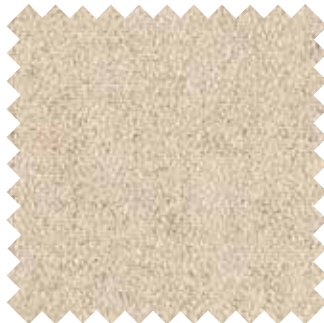
FACET 1 NATURAL