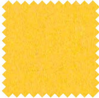
FACET 22 MAIZE